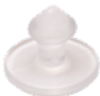
Fixation button for rubber Belt Befestigungsknopf für Gummigurt