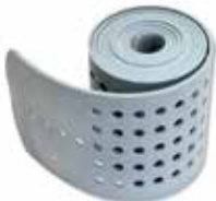
Chest Electrodes rubber Belt Brustwand-Gummigurt