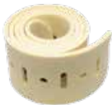
Extremities Electrodes rubber Belt Extremitäten-Gummigurt