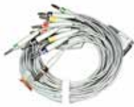
ECG cable (New Type) banana type EKG Patienten-kabel (Neuer Typ) Bananenstecker