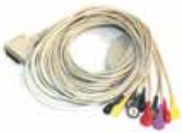
ECG patient cable with push button EKG Patienten-kabel mit Druckknöpfen